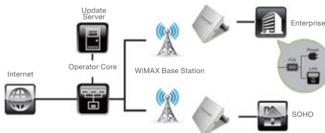
Enjoy WiMAX connectivity, even in challenging environment with the OS Series WiMAX Outdoor Modem

The OS series is built with the TR069 interface for a standard configuration system to facilitate batch remote configuration and over-the-air firmware update. Additionally, remote troubleshooting interfaces are available via telnet and the Web to assist second-tier support personnel. This relieves Operators from heavy maintenance efforts.